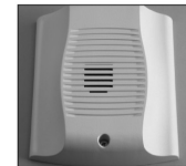
External Sounder provided with base model (DE8310)